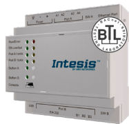
INBACSAMXXXO000 NASA VRF Systems 4/8/16/64 I.U.