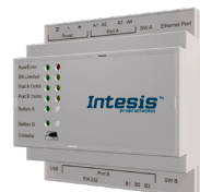
INMBSSAMXXXO000 NASA VRF Systems 4/8/16/64 Indoor Units