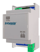
INMBSSAM001R100 NASA AC Units 1 Indoor Unit