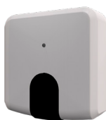
INWMPUNI001I000 Universal Infrared AC 1 Indoor Unit