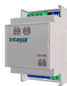
INMBSSAM001R000 NO NASA AC Units 1 Indoor Unit