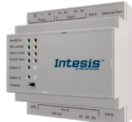
INKNXSAMXXXO000 NASA VRF Systems 4/8/16/64 I.U.